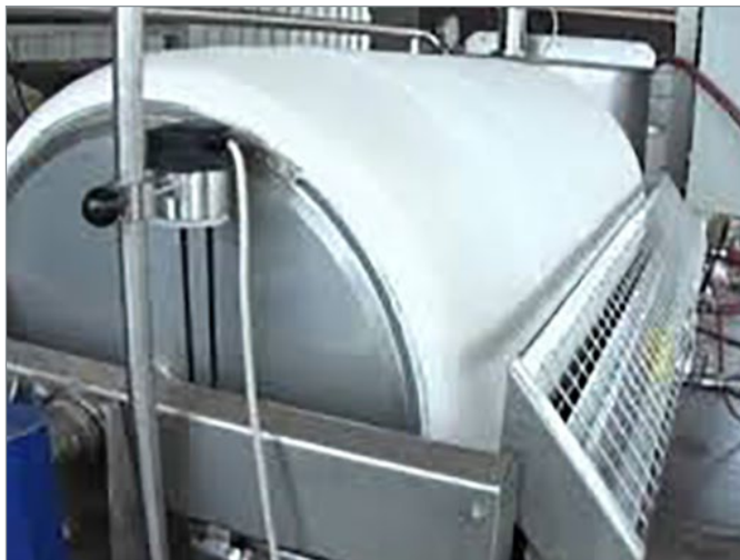
Figure 3 • Drum filter with PFA precoat