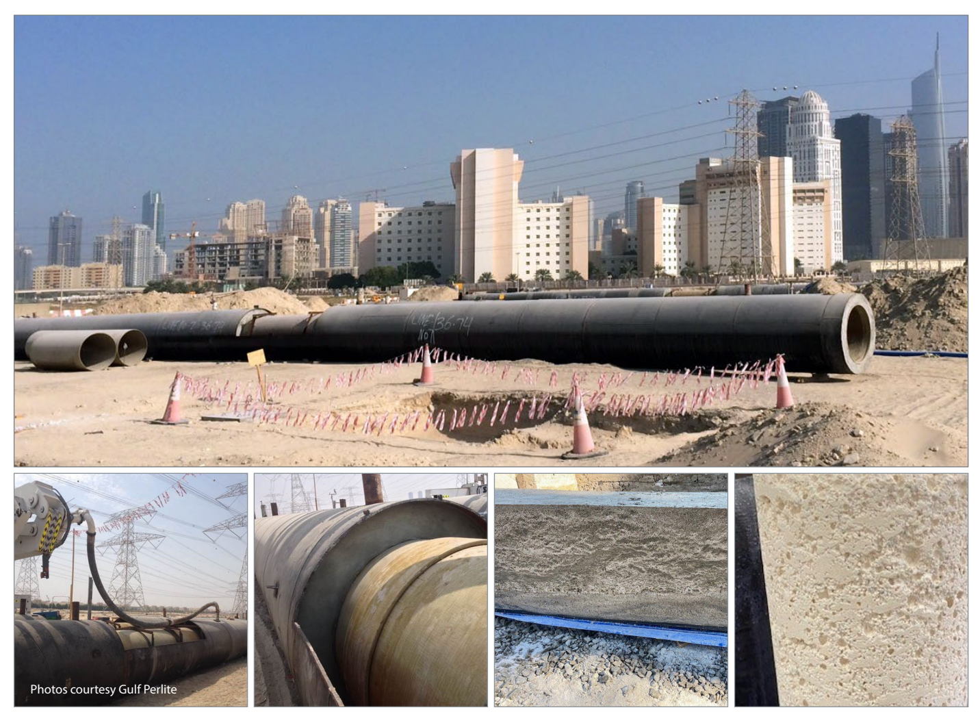
Perlite concrete pipe insulation provides a seamless, lightweight, quality thermal insulation that is also fire, rot, and vermin proof.

Top • Perlite concrete-encased metal pipe sections ready to place into the ditch. Pipeline was infilled with ready-mixed perlite lightweight concrete, at density of 1,000 Kg/m³. Perlite concrete was used to protect the pipeline from extreme hot weather and reduce the weight of the insulated sections, so the crane can lift it during installation, potential maintenance, or removal. Above from Left • Pumping perlite concrete into form around pipe section; cured insulative sleeve around pipe; perlite concrete blocks